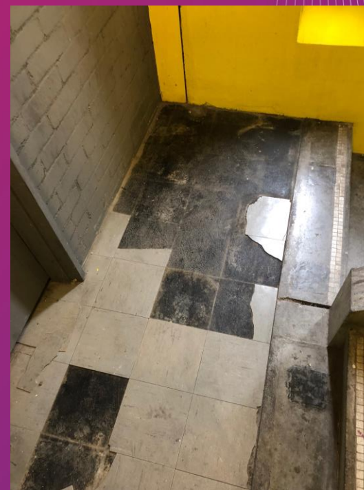
Floor Tiles throughout stairs