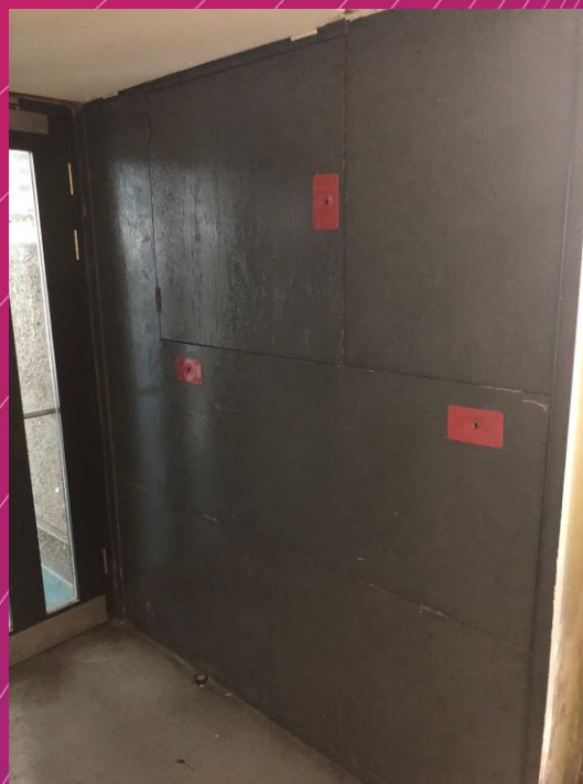
AIB & Debris within cupboards

Property in full occupation and constant use.