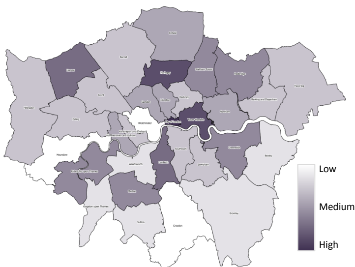
Map illustrating backlog for all highway assets (per km) by borough.

If the government is not willing to fund highways maintenance directly, then it must allow London local government greater control over its own assets and taxes. It should therefore look again at the recommendations of the London Finance Commission.