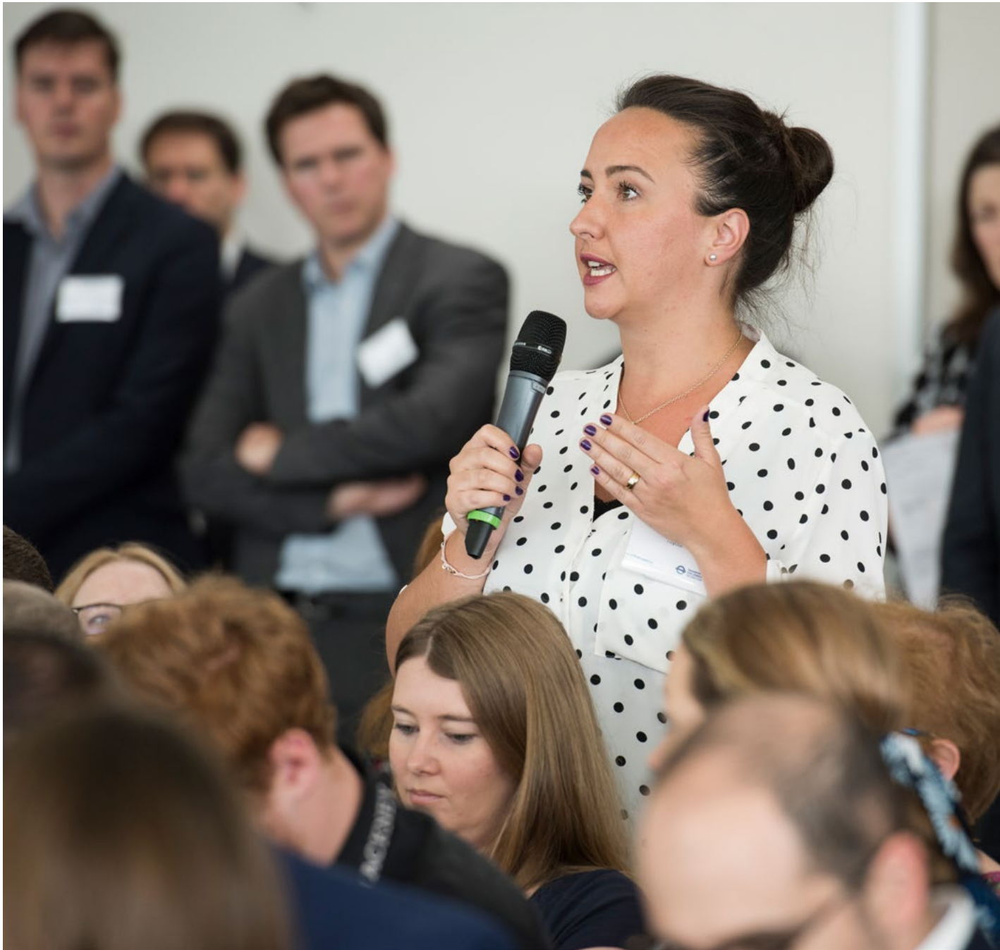
Image 3 Q&A session at the launch of the EV Infrastructure Taskforce

The situation is complex, there are numerous stakeholders involved and the Mayor of London has limited powers and cannot impose infrastructure deployment. However, there are a number of ways we can help facilitate charge point installation and unblock the barriers