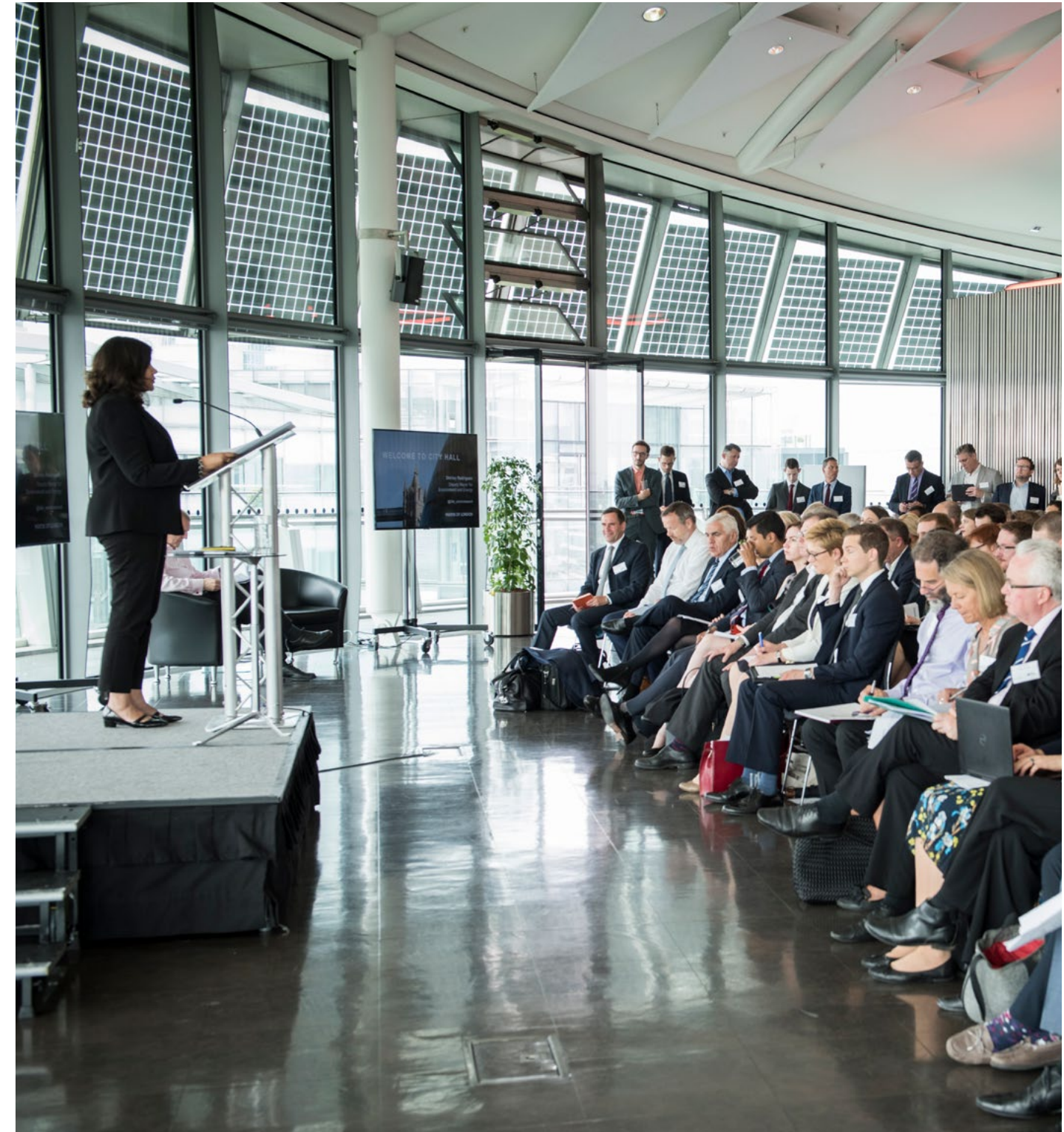
Image 2 Shirley Rodrigues, Deputy Mayor for Environment and Energy, addressing delegates at the launch of the EV Infrastructure Taskforce