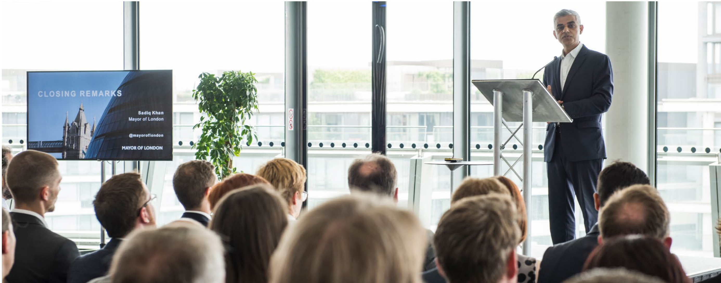
Image 1 The Mayor addressing delegates at the launch of the EV Infrastructure Taskforce