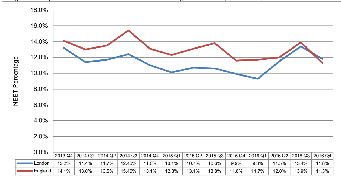
Figure 5: Comparison between 16-24 NEET in London and England over time (SFR11/2017)